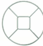
12" MUM SUPPORT RING